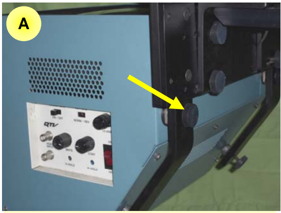
Start by removing the old CRT. There are 2 thumbnuts to unscrew - they can be used to mount the new display.

They are the highest quality displays available Proudly built in North America