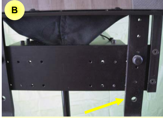
Remove both CRT support arms - these are fastened from the back with allen head screws.