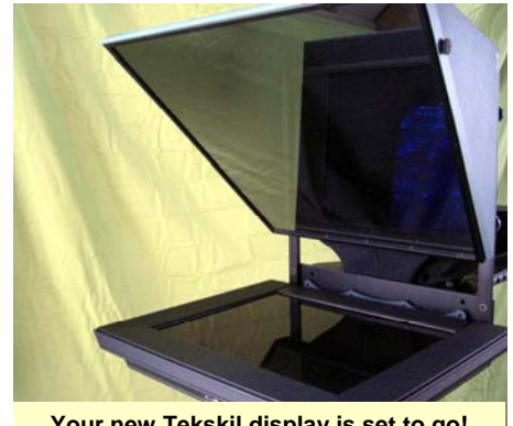
Your new Tekskil display is set to go!