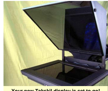
Your new Tekskil display is set to go!