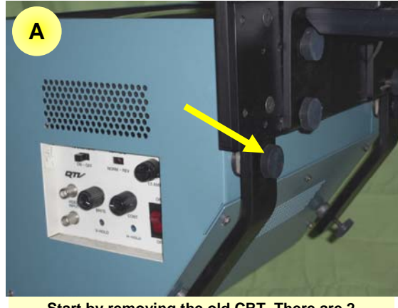
Start by removing the old CRT. There are 2 thumbnuts to unscrew - they can be used to mount the new display.