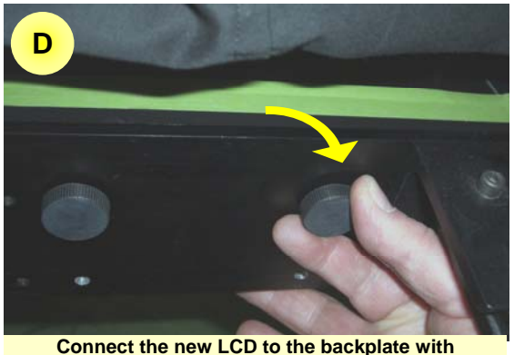
thumbscrews or the supplied conversion hardware