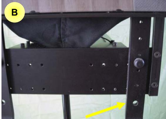
Remove both CRT support arms - these are fastened from the back with allen head screws.