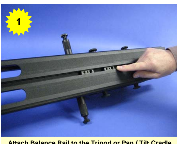
Attach Balance Rail to the Tripod or Pan / Tilt Cradle

If you have questions or suggestions – call us toll-free at 877-Tekskil (835-7545)