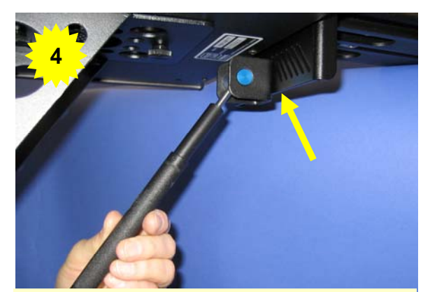
Slide upper end of Aux Display support arm into the slot in the Rail face plate and secure with thumbwheel