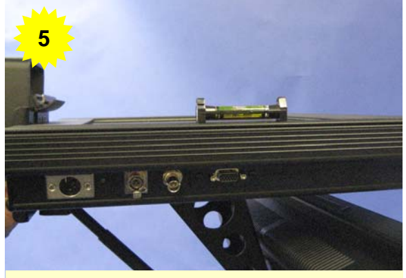
Level the Prompter Display by extending Aux Display support arm (turn counterclockwise - step 4 detail)