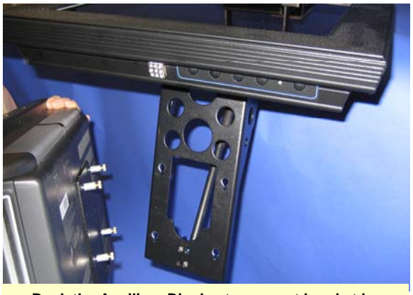
Dock the Auxiliary Display to support bracket by inserting the 4 knurled thumbnuts into the keyholes