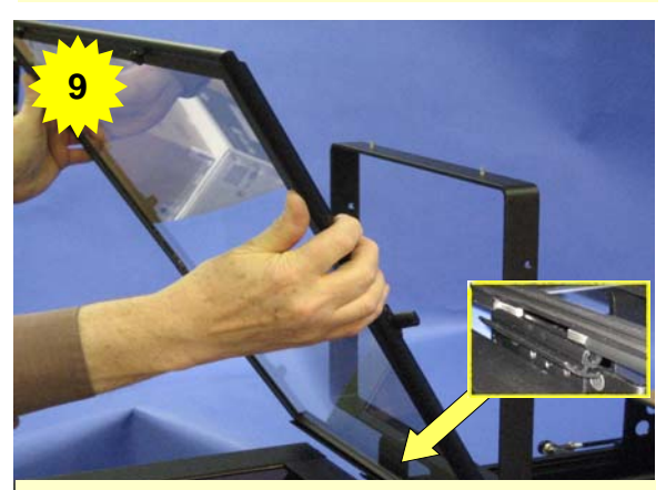
Mount the Beamsplitter Frame into the support bracket - orient the shaft flats vertically for insertion