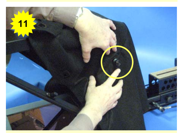
Fasten the Cloth Shroud to the Frame. Attach to the stabilizer posts using the appropriate button hole.