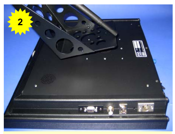
Attach the Aux Display Bracket to the underside of the Prompter Display with the 4 thumbnuts