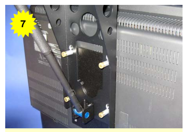
Tighten the knurled thumbnuts (barrel nuts) to secure the Auxiliary Display to the support bracket