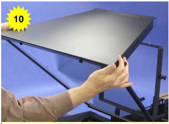
Install top panel – fasten the front thumbscrew and top knurled nuts. Support the glass during this step