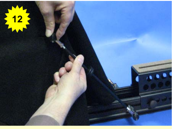
Connect stabilizing struts to the upper and lower posts – tension as needed. Mount the camera and fine balance the completed assembly.